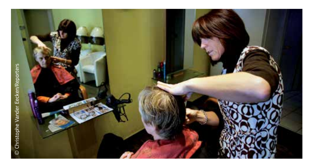
Europeans are free to live and work in any EU country that they choose.

As a citizen of the European Union you are not just a worker or a consumer: you also have specific political rights. Since the Maastricht Treaty came into force, regardless of your nationality, you have had the right to