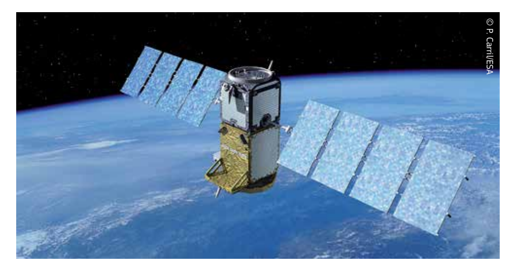
The EU encourages innovation and research such as 'Galileo', Europe's own global navigation satellite system.

is to prevent contamination of the air, water, soil and buildings, to preserve biodiversity and to improve the health and safety of EU citizens while at the same time keeping European industry competitive.