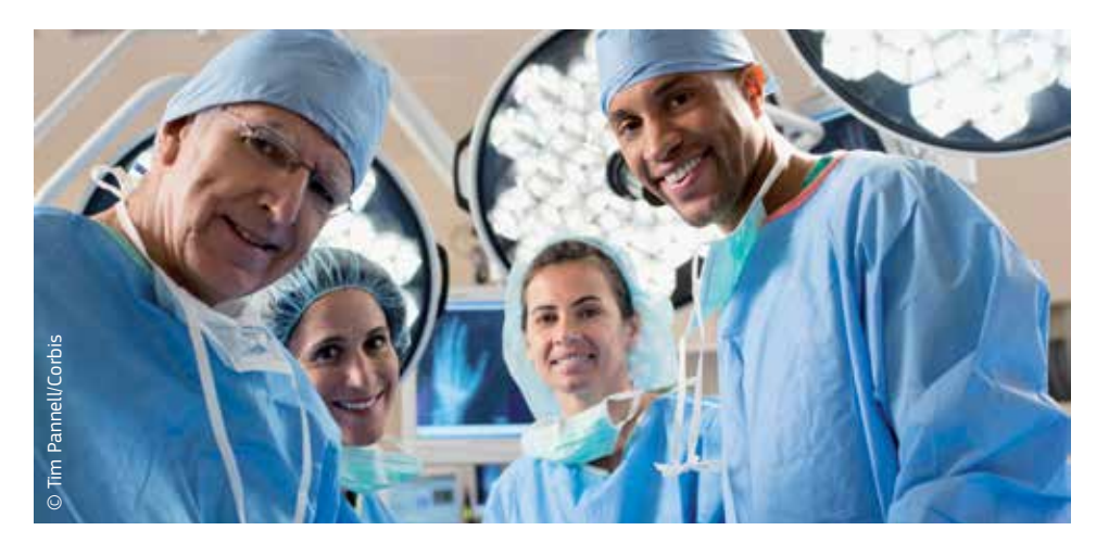
As the EU's population ages, legal immigrants with the right qualifications are helping to bridge the gaps in the labour market.

The free movement of people within the EU raises security issues for the Member States, since they no longer control internal EU borders. To compensate for this, extra security measures have to be put in place at the EU's external borders. Moreover, since criminals can also exploit freedom of movement within the EU, national police forces and judicial authorities have to work together to combat cross-border crime.