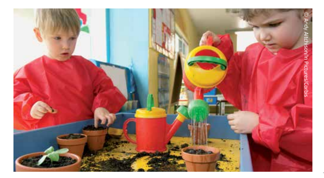
Europeans need to work together today for their future tomorrow.

At the same time, the economic crisis has shown that the countries that use the euro as their currency are in a special situation of dependency which has led them to function as a core group of countries within the EU.