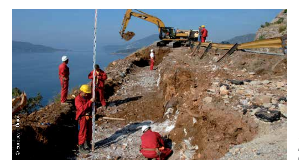
The EU gives financial aid to help build the economy in neighbouring countries.

The EU's financial assistance to both groups of countries is managed by the European Neighbourhood and Partnership Instrument (ENPI).