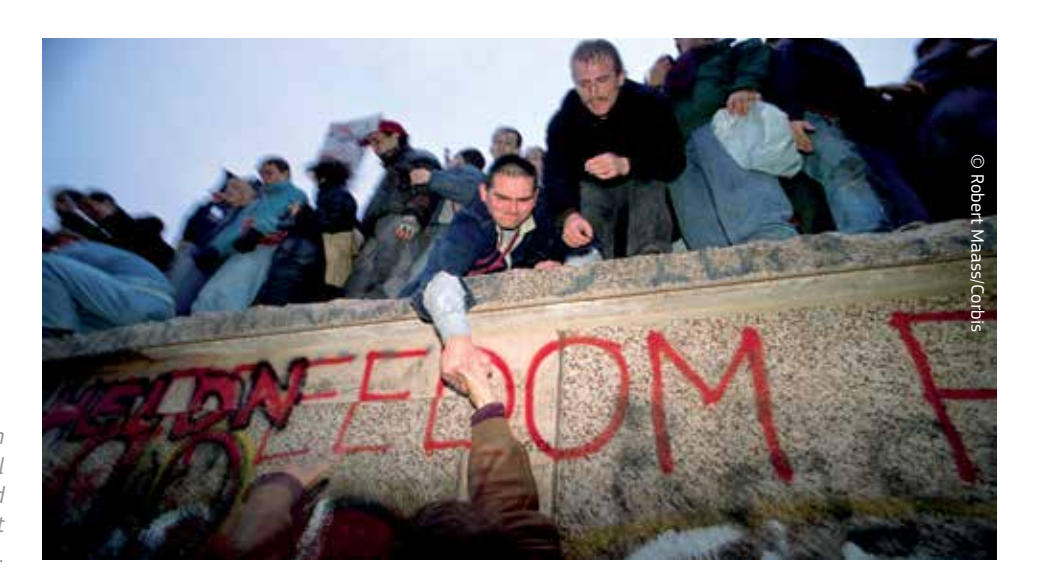
The fall of the Berlin Wall in 1989 led to a gradual breaking down of old divisions across the continent of Europe.

The European Union encouraged German unification after the fall of the Berlin Wall in 1989. When the Soviet empire crumbled in 1991, the countries of central and eastern Europe, which had for decades endured life behind the 'iron curtain', were once again free to choose their own destiny. Many decided that their future lay within the family of democratic European nations. Eight of them joined the EU in 2004, two more followed in 2007 and Croatia joined in 2013.