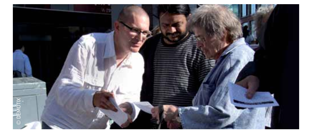
A more democratic Europe: thanks to the Lisbon Treaty, European citizens can now propose new laws.

The European Council fixes the EU's goals and sets the course for achieving them. It provides the impetus for the EU's main policy initiatives and takes decisions on thorny issues that the Council of Ministers has not been able to agree on. The European Council also tackles current international problems via the 'common foreign and security policy' — which is a mechanism for coordinating the foreign policies of the EU's Member States.