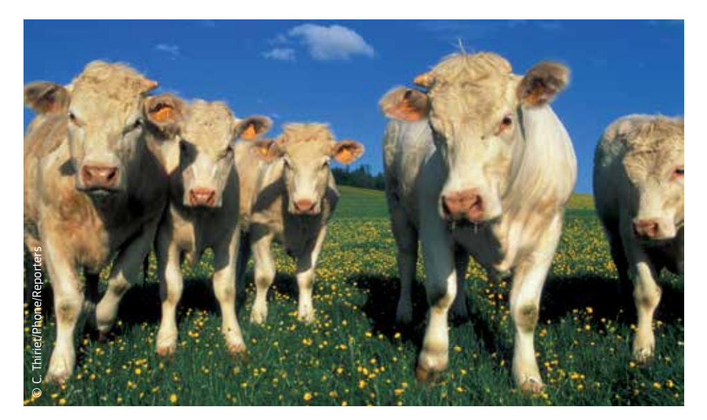
Agriculture must provide safe food of good quality.

The European Commission represents the EU in international negotiations at the World Trade Organisation (WTO). The EU wants the WTO to put more emphasis on food quality, the precautionary principle ('better safe than sorry') and animal welfare.