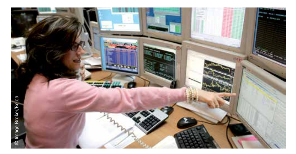
New EU rules on economic and financial governance have helped to clean up and strengthen the banking sector.

The European Union also takes action to protect consumers from false and misleading advertising, defective products and abuses in areas such as consumer credit and mail-order or Internet selling.