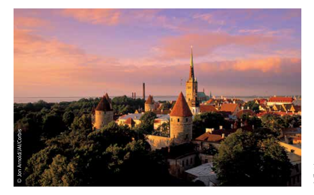
Tallin, the capital of Estonia, where the euro replaced the 'kroon' in January 2011.

The Eurogroup consists of the finance ministers from the euro area countries. They meet to coordinate their economic policies and to monitor their countries' budgetary and financial policies. The Eurogroup also represents the euro's interests in international forums. In January 2013, the Dutch finance minister, Jeroen Dijsselbloem, was elected President of the Eurogroup for a period of two and a half years.